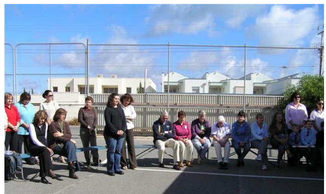
Star of the Sea Teachers, Parents and MDC Volunteers