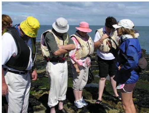
They all made it safe back to the beach.