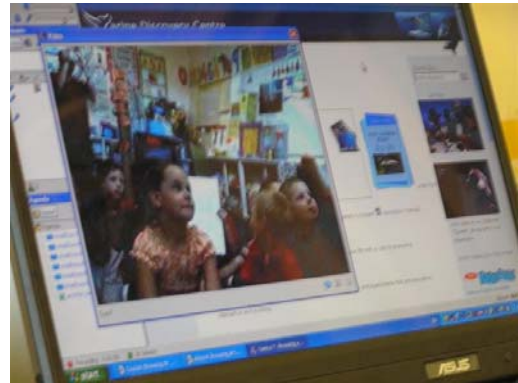
on the other end of the web-cam