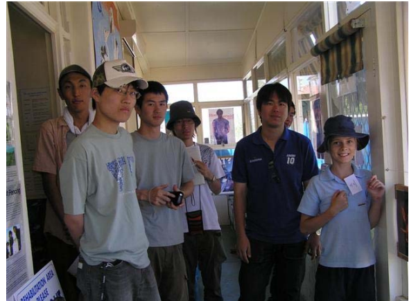
Star of the Sea students with the Rakuno University students