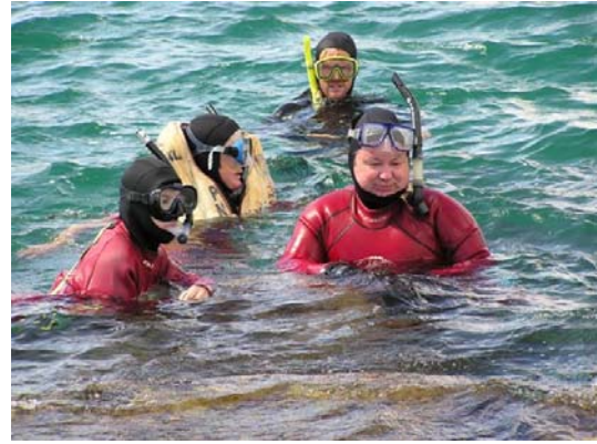
they all had fun in the water