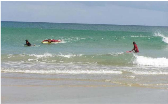
Surfing is fun.....