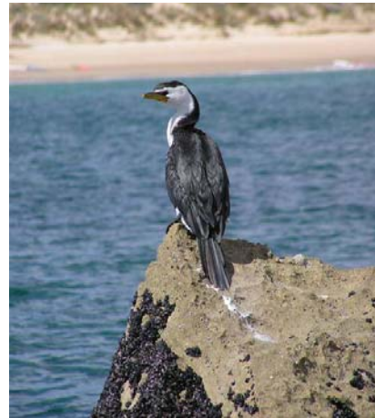
The Cormorant is keeping an eye on our volunteers