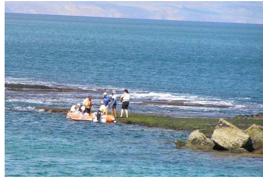
Marine Trail: this time the marine trail was on the reef