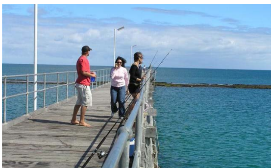
Fishing: instructions first, fun later