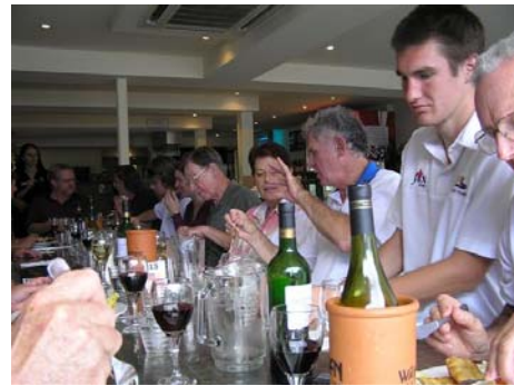
enjoyed by everyone

The Workshop lunch was held at Quattro Restaurant, Comfort Inn, Holdfast Shores.