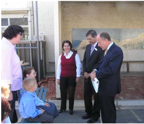
Sen. Eric Abetz talking to the students