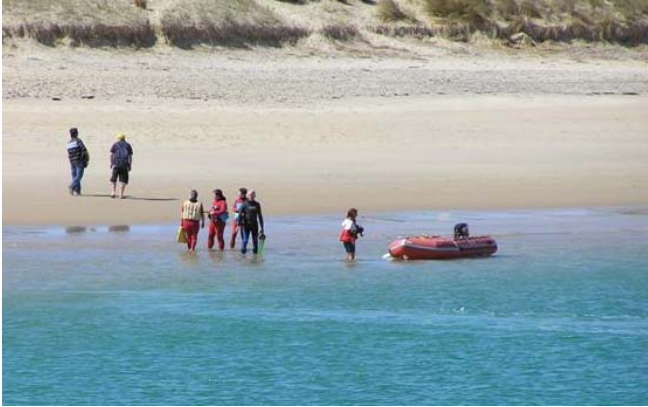
Snorkelling: getting in the boat