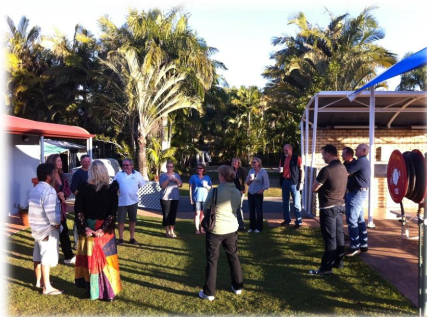
A sharing circle