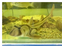
Port Jackson Shark