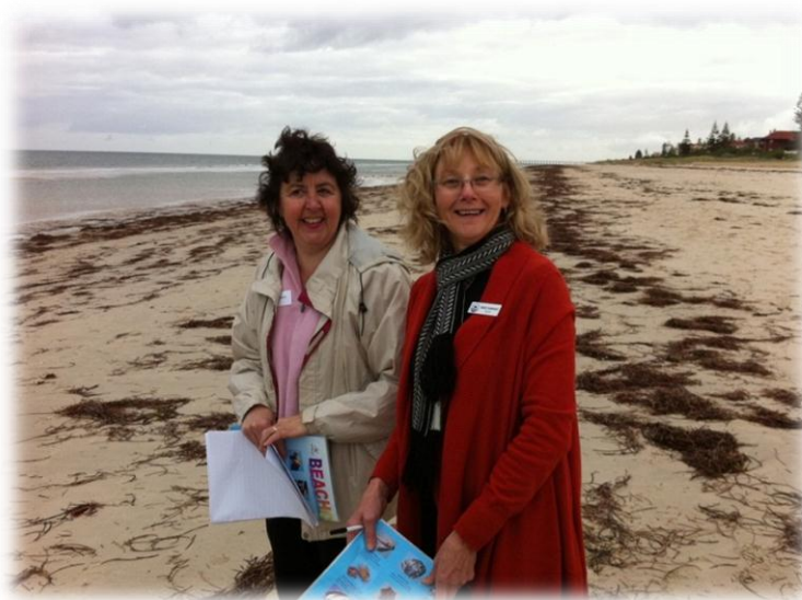
Our Beachcombing Poster was very useful for the Marine Trail.