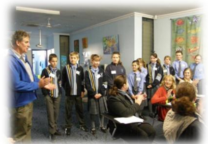
MDC Student Leaders.