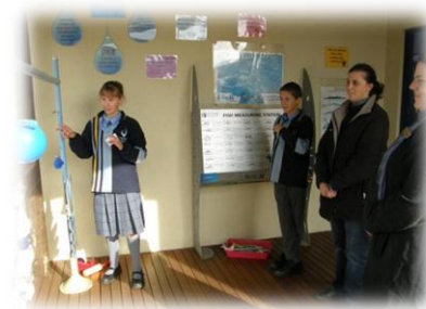
MDC Station shown to the participants by our Student leaders from the Star of the Sea School.