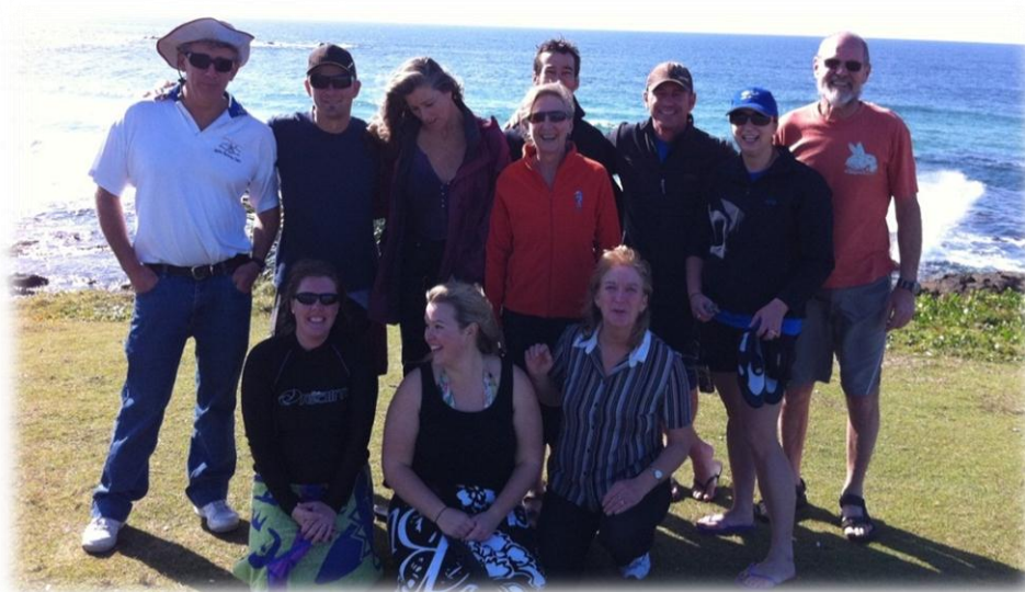
Some of the group after a discovery trail around Hastings Pt