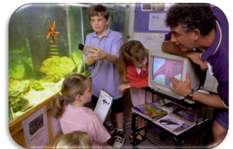
Our visitors can get a close-up view